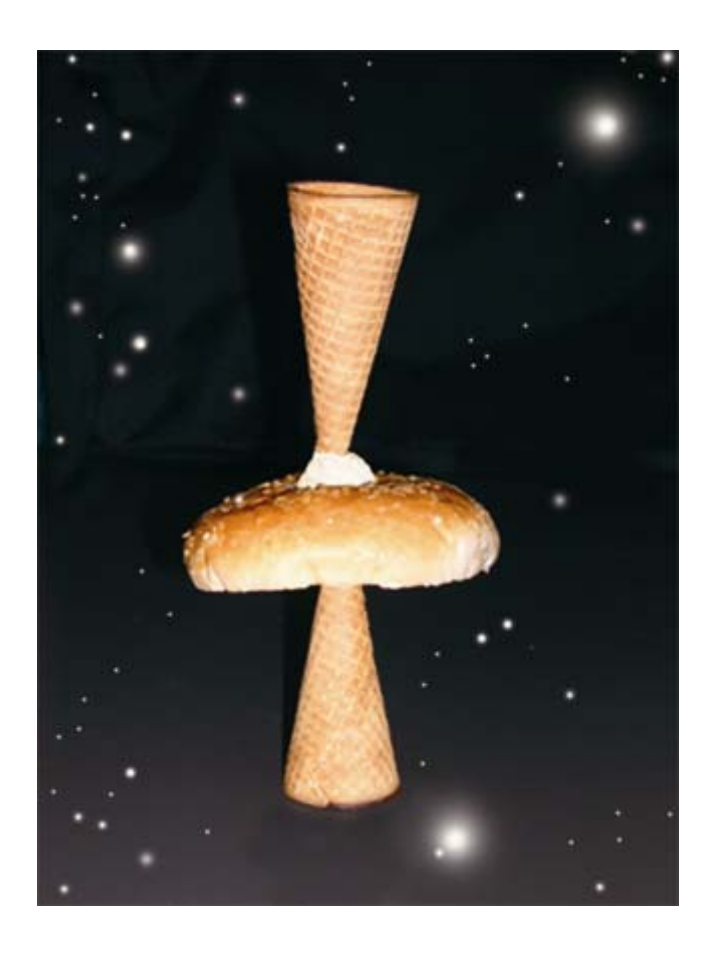
For more information, please see: http://glast.sonoma.edu/teachers/teachers.html