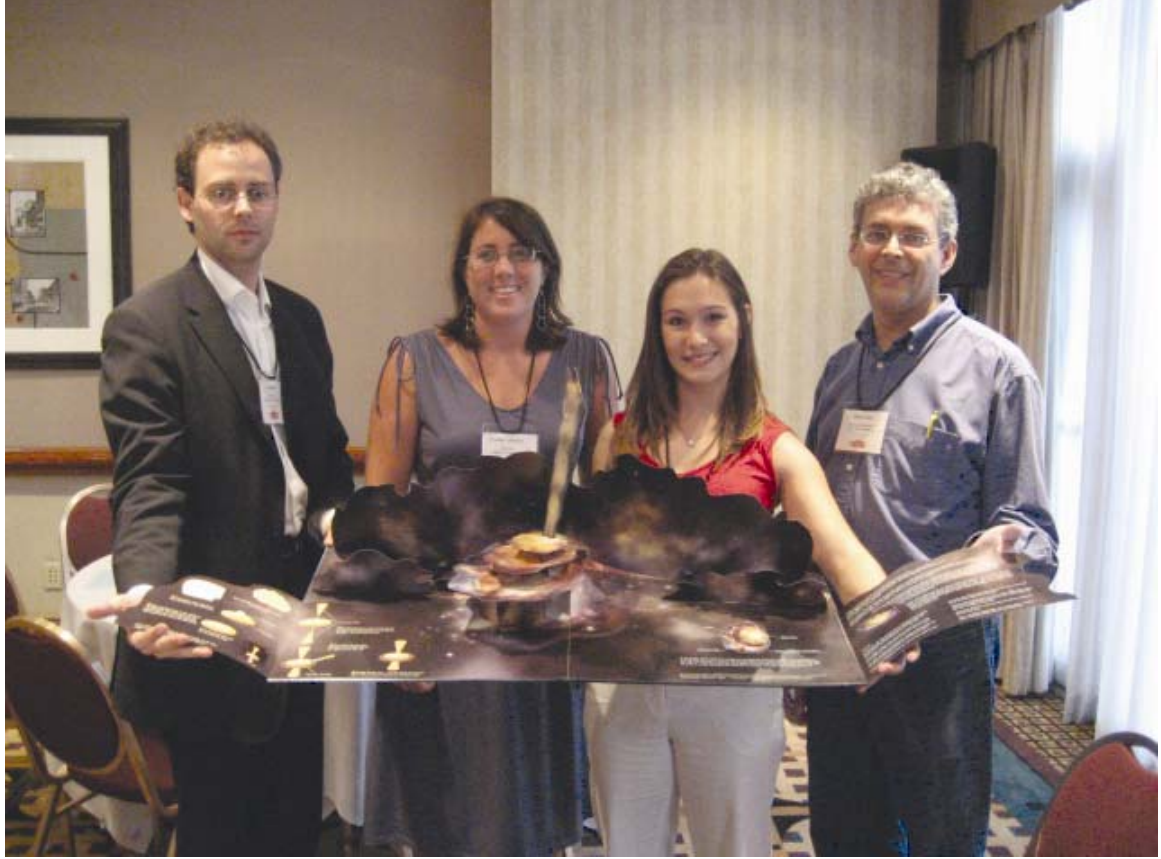
Before Using the Pop-Up Book in Your Classroom Some preparation must be done before presenting the book to your students. Grades 3-4:

The pop-up book itself is only distributed to educators who are trained in its use. For more information about obtaining a pop-up book for your classroom please contact Lynn Cominsky at: lynnc@universe.sonoma.edu .